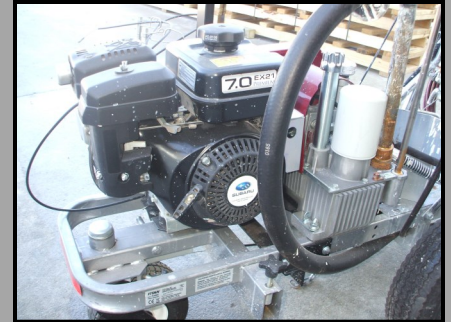
Subaru 7.0 HP Engine

Titan 6950 Double Gun Airless Walk Behind Striper, 15 Gallon Paint Tank, Subaru 7.0 HP Engine, Detachable Hand Gun with 50' Paint Hose for Remote Stenciling, Electric Start Engine