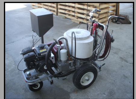
15 Gallon Paint Tank and Bead System