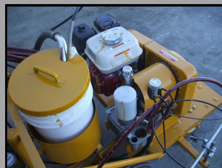
5 Gallon Pail Holder with Sealed Bottom