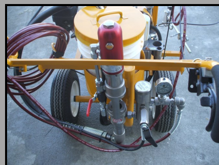
High Pressure Hydraulic Powered Airless Spray System

Kelly-Creswell Power Pro Plus Single Gun Airless Walk Behind Striper, 5 gallon pail holder with sealed bottom, detachable hand gun with 50' of paint hose for remote stenciling, rugged KC frame.