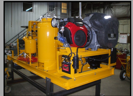
NEW 20 HP Honda Engine Refurbished Atlas Copco Comp.