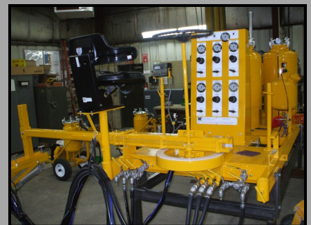
NEW Rear Mounted Operator Control Panel

Refurbished 2000-AS palletized striping unit with Rack and Pinion Steering, 2 - 25 gallon SS Paint Tanks and a 300# CS Bead Tank.