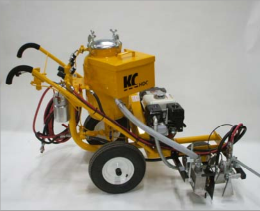
Heavy-Duty Model C with 40# gravity bead hopper and FF-6