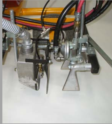
Typical portable installation