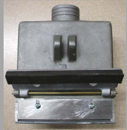
Adjustable gate for accurate application